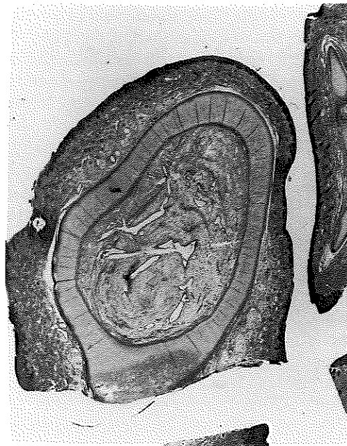
Fig 2. Low-power photomicrograph of Armed Forces Institute of Pathology case of "pharyngeal hairy polyp" (ie, accessory auricle) with section through circular plate of cartilage with thickness similar to that of normal auricular cartilage.

the histologic appearance of the dermoid polyps to the appearance of fetal auricles confirmed the general resemblance of the polyps to auricles.